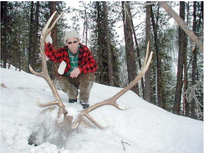
As the snow settled in 2002, Garden Valley residents located bull elk that had attempted to find feed on the "wind-blown ridges" by spotting an antler sticking out of the snow.

The LSC and his Supervisors in the SW Region apparently did not realize that all of the elk that had remained on the ridges pawing for food where already buried under several feet of snow. As the snow settled, antlers sticking out were stark reminders of Regional IDFG officials' refusal to follow feeding guidelines in the law.