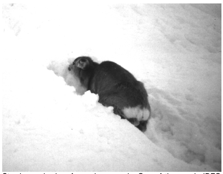
Starving mule deer fawn above road. One of thousands IDFG refused to feed in violation of IDAPA 13.01.18.