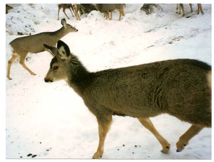
Mule deer being fed "free choice" by private citizens one month before IDFG began token feeding. Note thrifty condition of fawn.